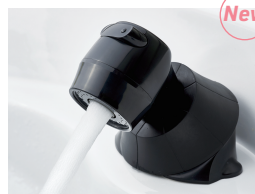
Dual function shower head "e"

The low-splash shower that provides comfortable spray of water containing air has about 20% *1 reduction in water outlet compared with our previous product but with the same washing sensation and usability. The dual function shower head and low-splash shower head will be changed to water-saving specifications.