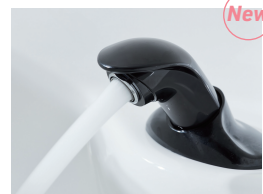
Low-splash shower head "e"

Note: Compatible with water saving only for low-splash shower mode